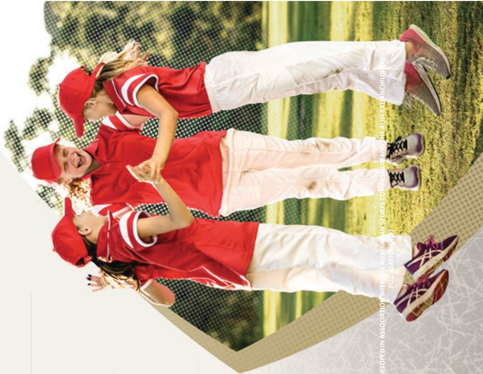
THIS RESOURCE HAS BEEN DEVELOPED IN ASSOCIATION WITH THE AUSTRALIAN SPORTS COMMISSION AND THE AUSTRALIAN CHILD PROTECTION FOUNDATION (ACPF)

There may be exceptional situations where this Code of Behaviour does not apply, for example, in an