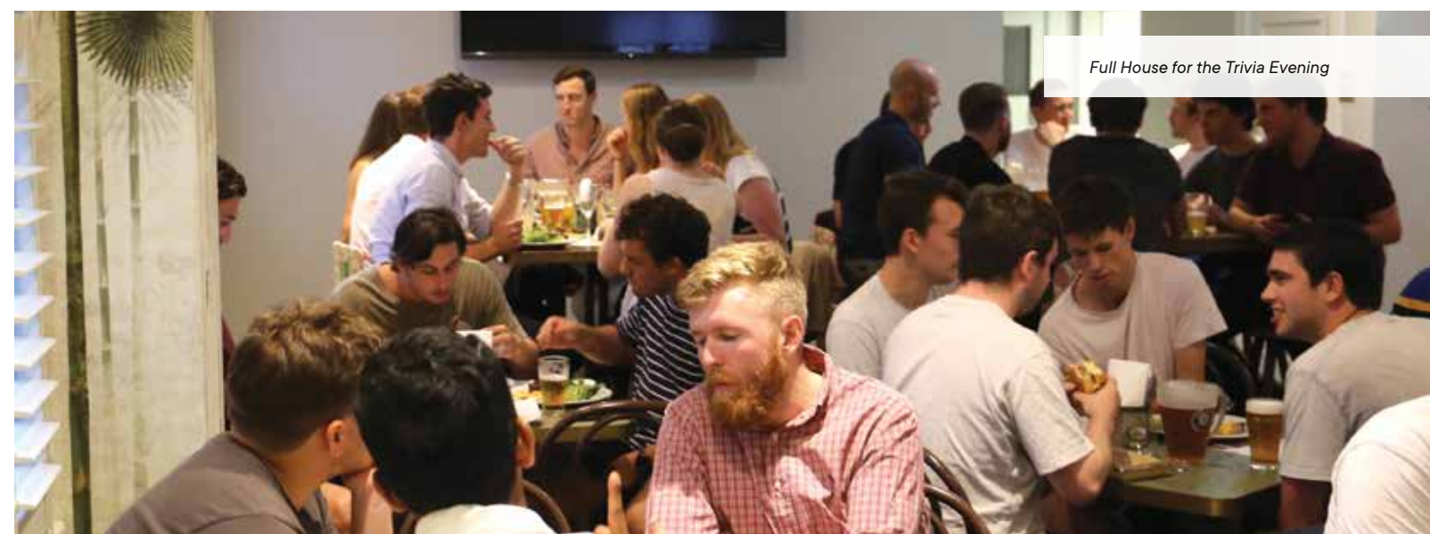
Full House for the Trivia Evening