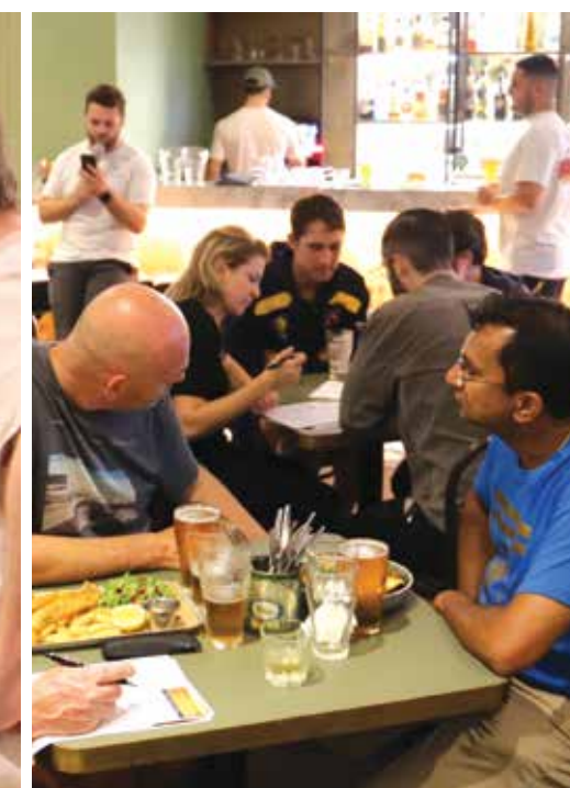
Great to see our parents involved