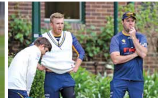
3rd Grade team support