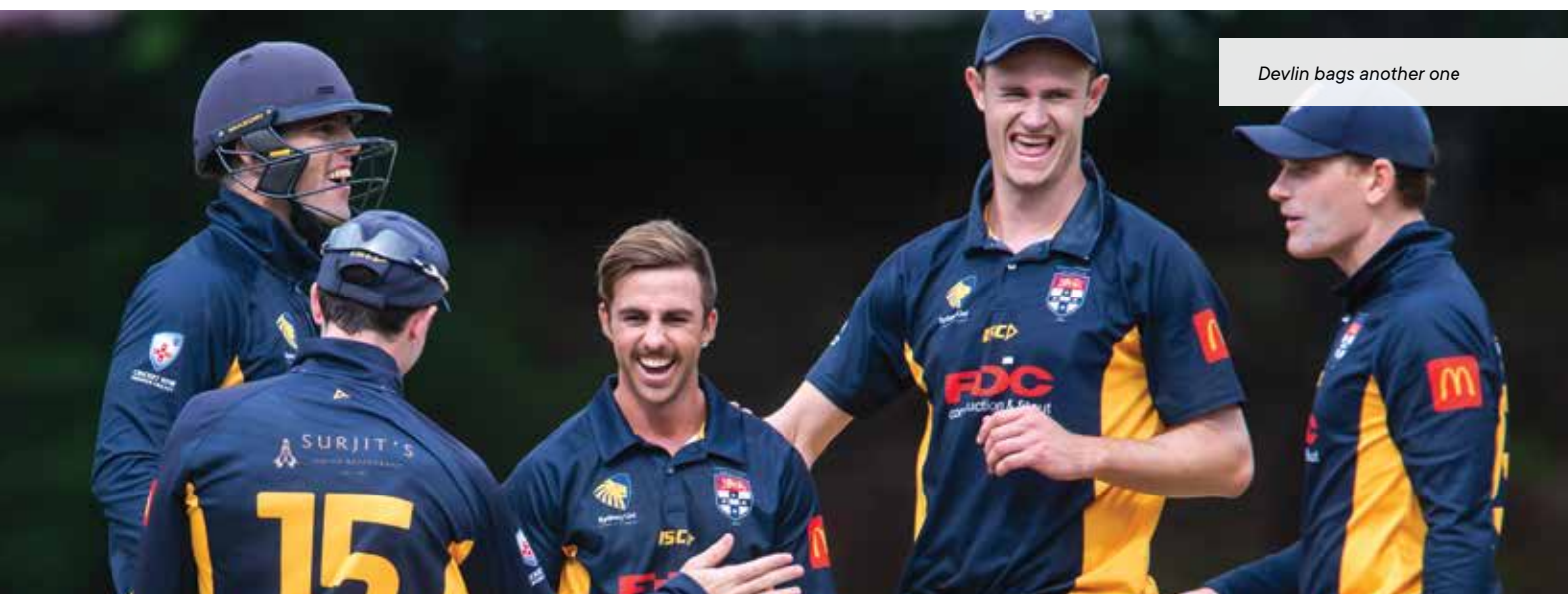
Devlin bags another one