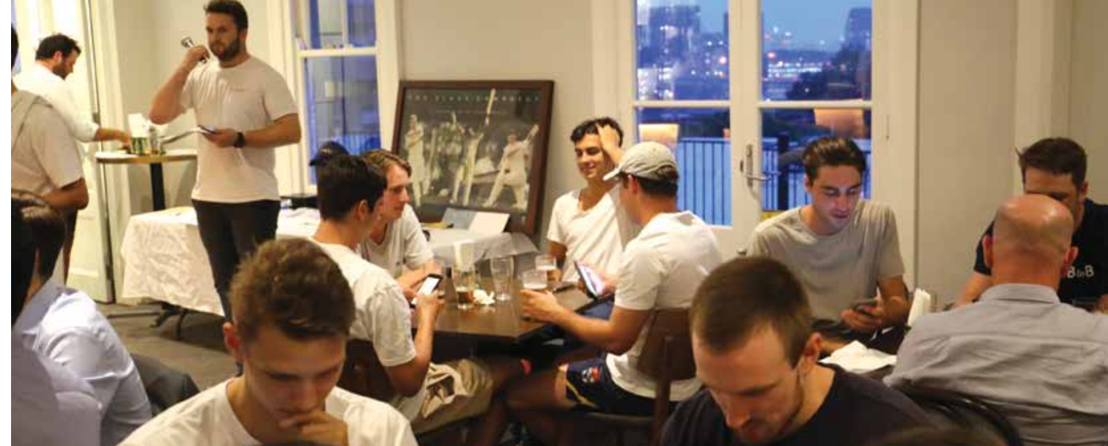
Magnificent venue—our thanks to The Toxteth Hotel