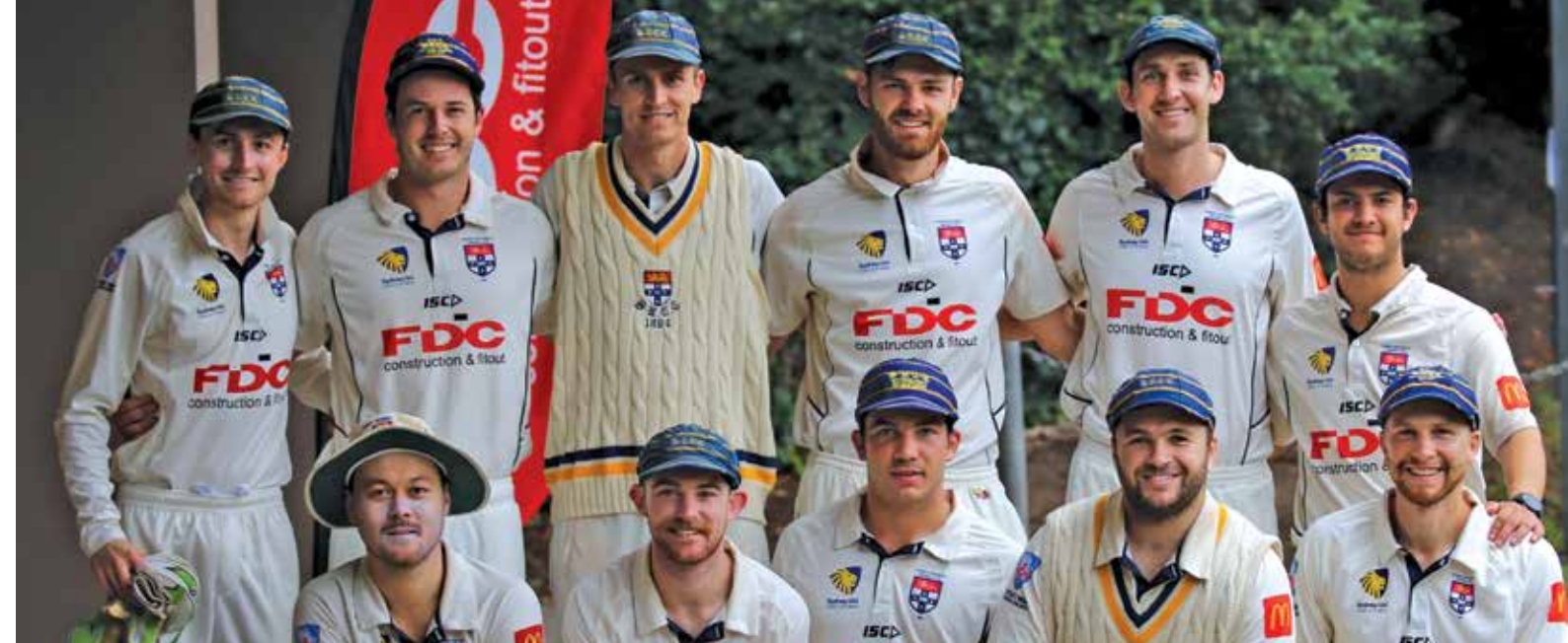
2nd Grade Team Season 2019-20