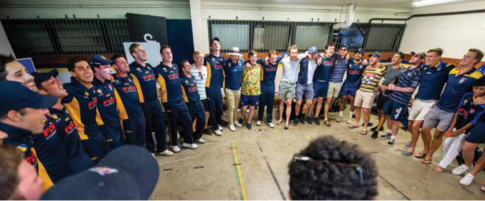
Limited Overs Cup Champions victory song in the sheds