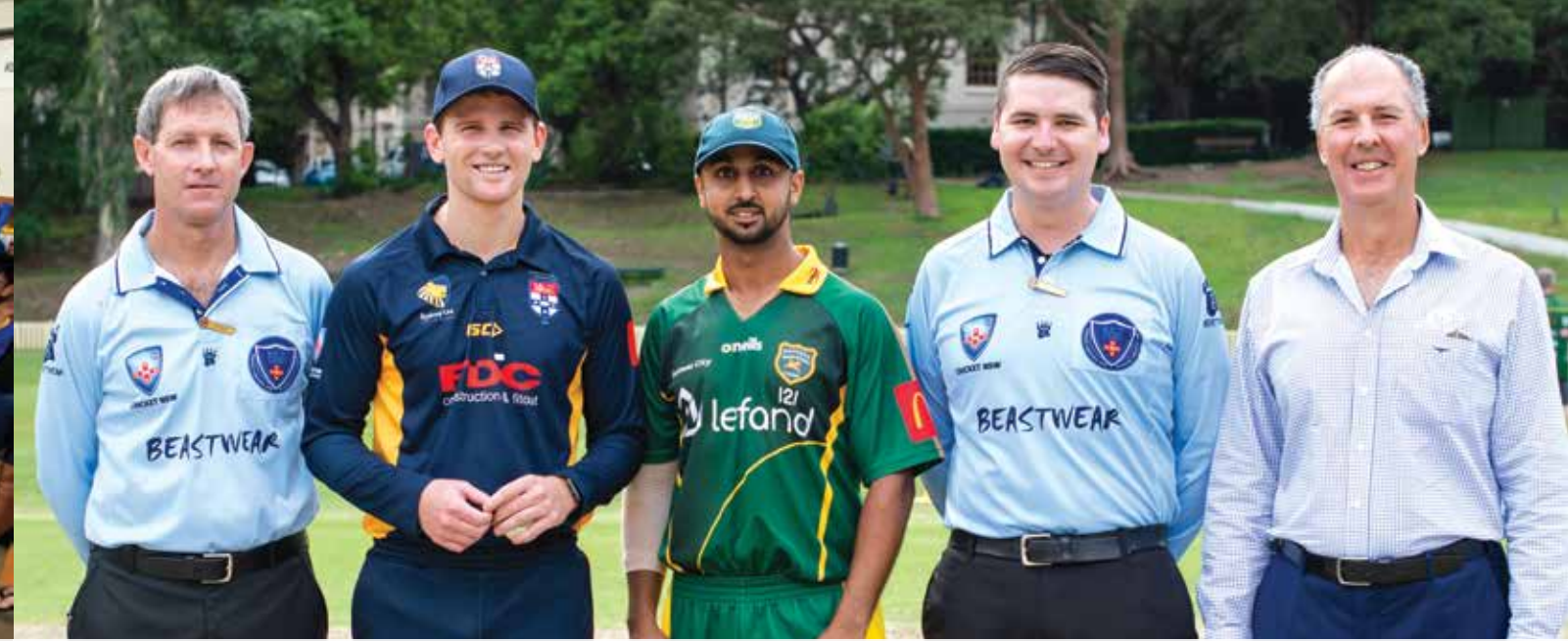
Captains and Officials Limited Overs Final